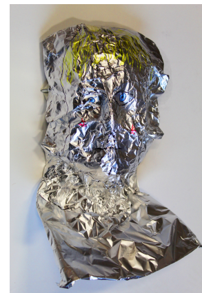
Eddie Blunt (Y7) Aluminium Foil Sculpture