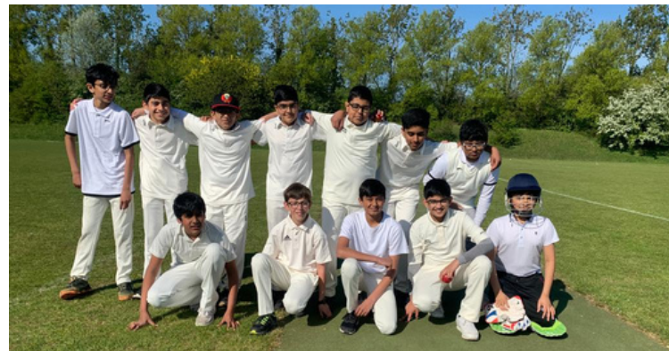
Year 7 B Cricket Team

The cricket season is up and running. We have already played against Latymer and Wallington. The matches tomorrow, Saturday 14 May, are against John Fisher. The Year 7 A team is playing at John Fisher School, and the Year 7 B team and Year 9s are playing at the John Fisher Sports Ground.