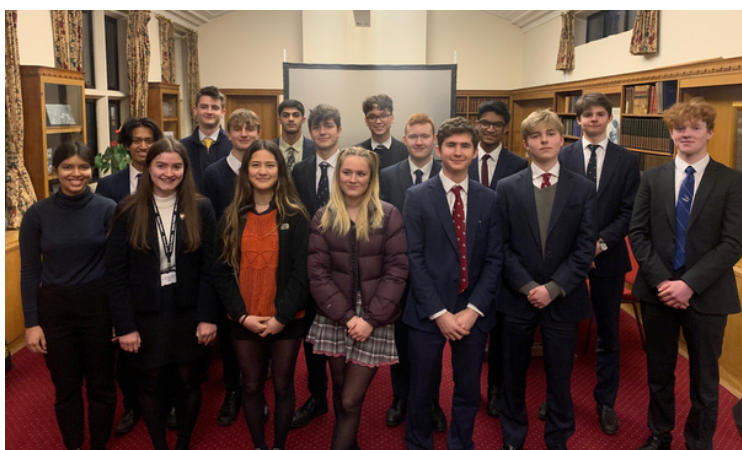
(Pictured above) The competing debating teams in Les Joutes Oratoires